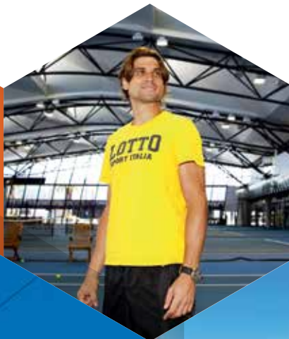
Spaniard David Ferrer visited the newly-opened state-of-the-art National Tennis Centre, featuring eight Italian clay courts, during Australian Open 2013. Additional Plexicushion practice courts and recovery facilities were also available to elite players.